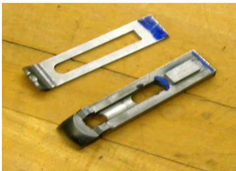
More gun-sight, still in progress. Tricky stuff!