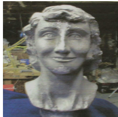
Nice clay sculpture. Looks REAL.