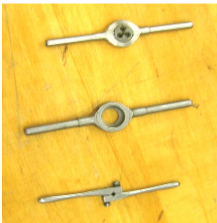
Shop-made selection of tap/die holders.