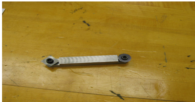
Holder made for carbides. Round one end, diamond the other.