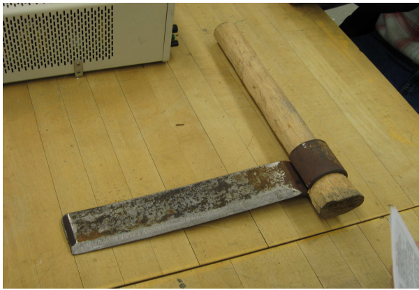
Log-splitter from a car-spring, for the wood-pile.....