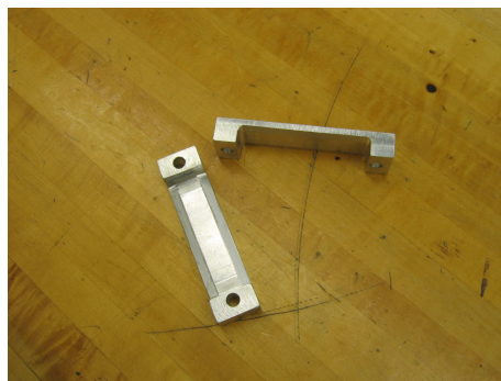
Some airplane parts. Gee..wonder how I knew THAT?