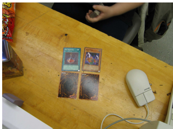
This is what Show & Tell USED to mean!