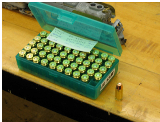
.....and makes reloading dies also!!