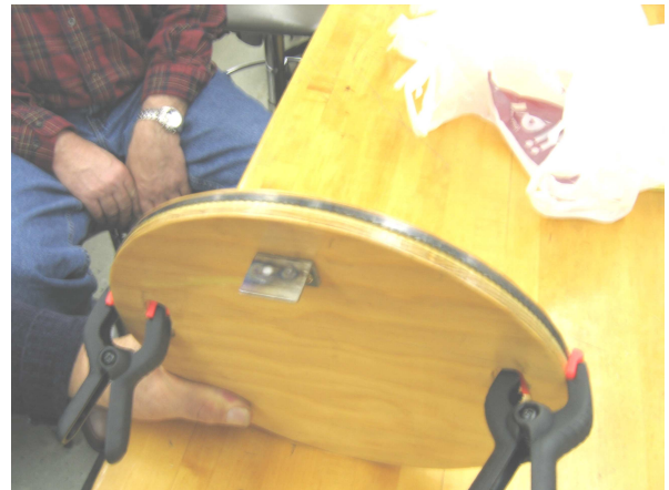
One of those "Now why didn't I think of that!" simple easy way to clamp and hold band-saw blade while grinding or filing the butt-weld smooth. Small bracket is the clearance gauge.