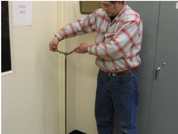
...and hand-drill driven chain flail to clean the creosote and carbon from the wood-stove chimney! Note how carefully he handles the sharpened edges of those last chain-links!!