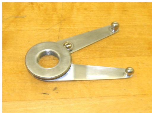
A very nice dividing head quadrant under way.

OK...time for your intrepid reporter to do a BiiiiG apology. I took lots of photos at the meeting, and I darn well knew I should sit down as soon as I got home and put names and captions to them all. Hey, No problem, I have the notes right....Uh...here...nope, oh—right here....hmmm..maybe in heerre..nope! Half hour looking, and GONE with the snow. So, I apologize, but I can't name who brought what, so I will just try to caption them, rather than put names to some and leave anybody out!. Very Sorry!!