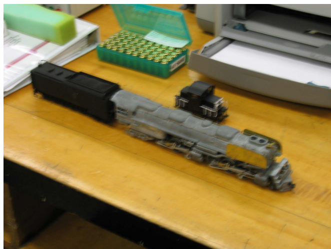
One of our members makes his own HO locos.....