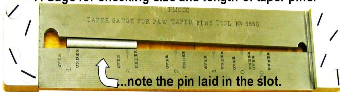
A Gage for checking size and length of taper pins.

Sorry, but I forgot to write down who brought this.