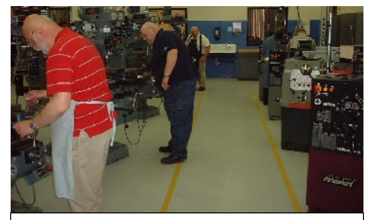
The mills were popular. I was using one myself.