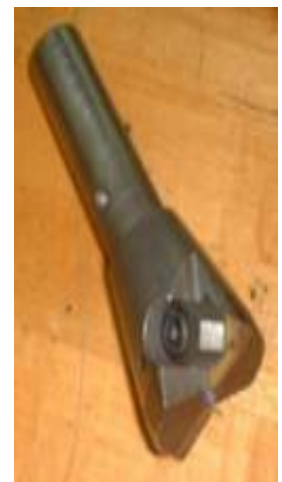
Hogging cutter with carbide Inserts.