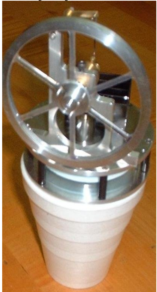
Low Temperature differential Stirling Engine

I wonder if the guys would be interested in bringing pictures in electronic form for inclusion in the newsletter. When I take a picture of a printed picture, the results are not the best. I will start bringing a thumb drive and we can use a school computer to transfer other media to it. It will let guys show things that are too big to bring in.