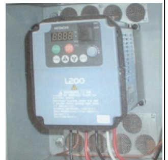
Ron's Variable Frequency drive.

THINGS I MISS: 25 cents / gallon gasoline