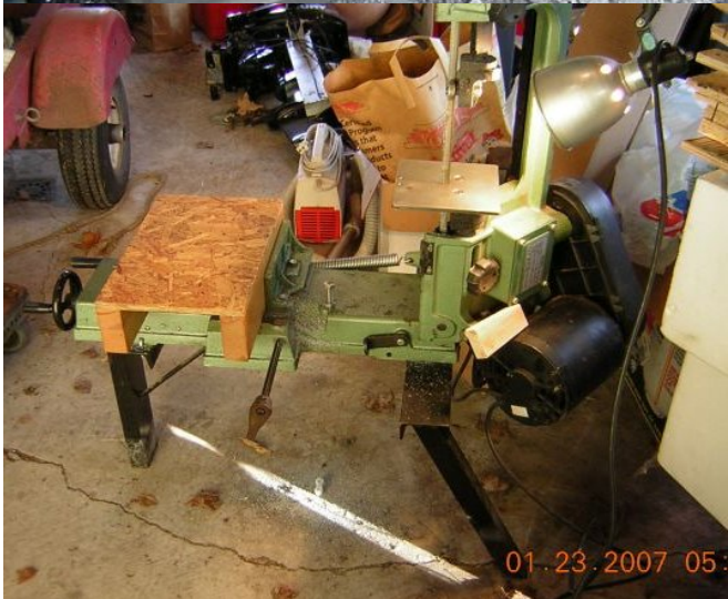
Bert Campbell, demonstrated a homemade carbide threading tool. Joe Pietsch, demonstrated a home-fabricated height gauge for measuring small parts.