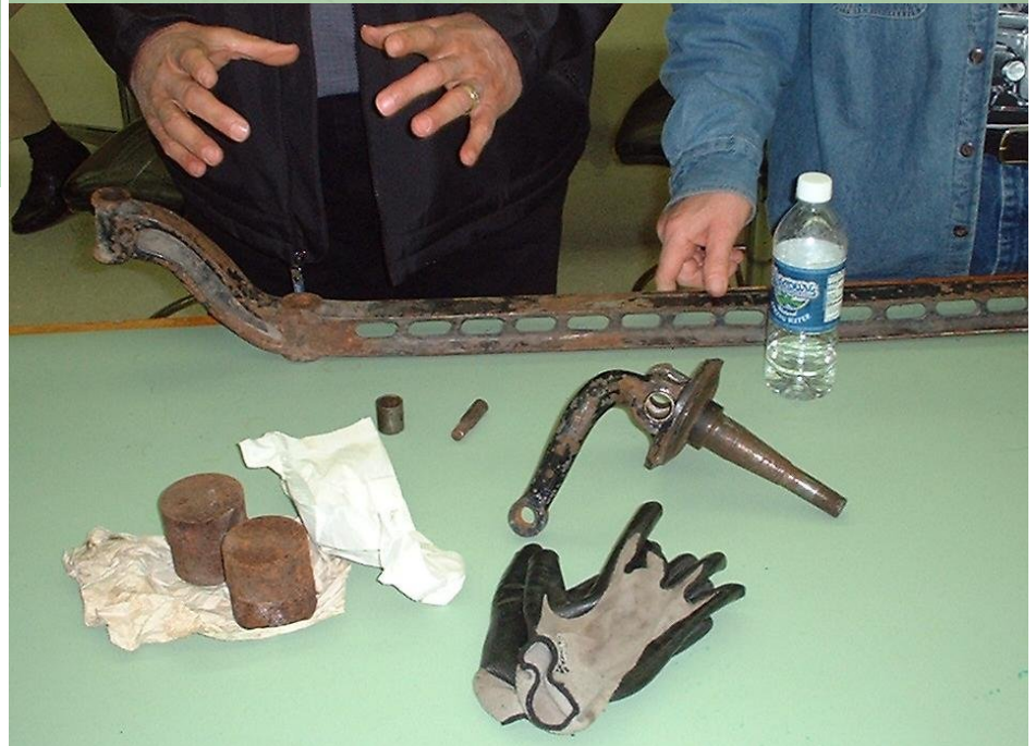
Modified rail of an antique car ->