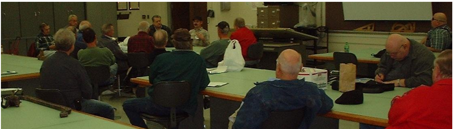
Members in the new meeting room