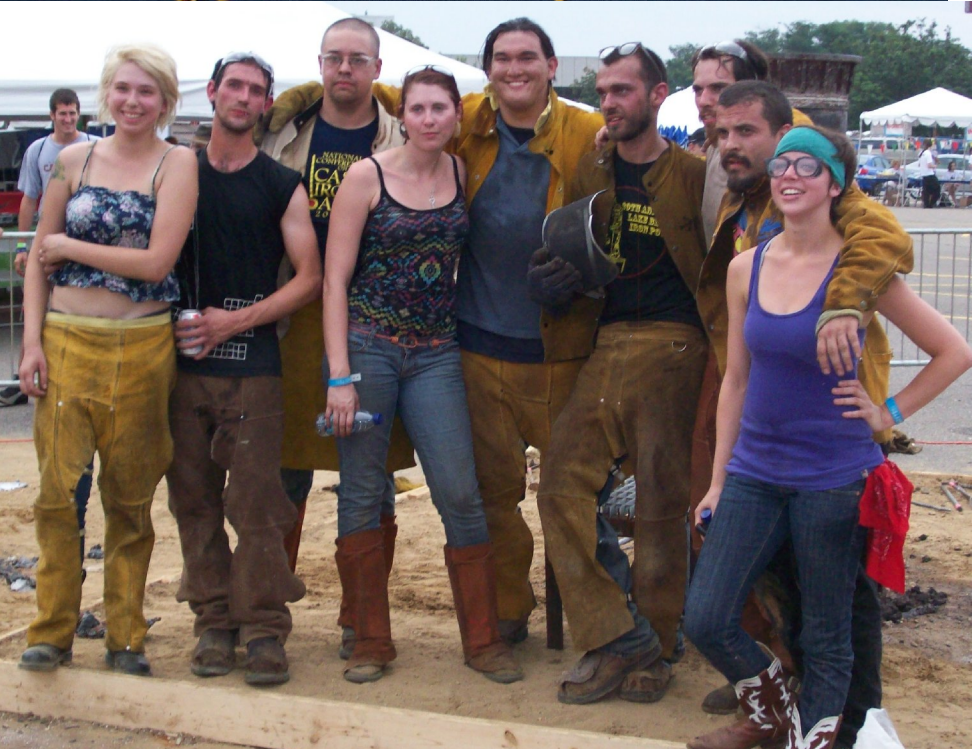
Now that's what I call Hot Women ! Group that just finished doing the iron pour.