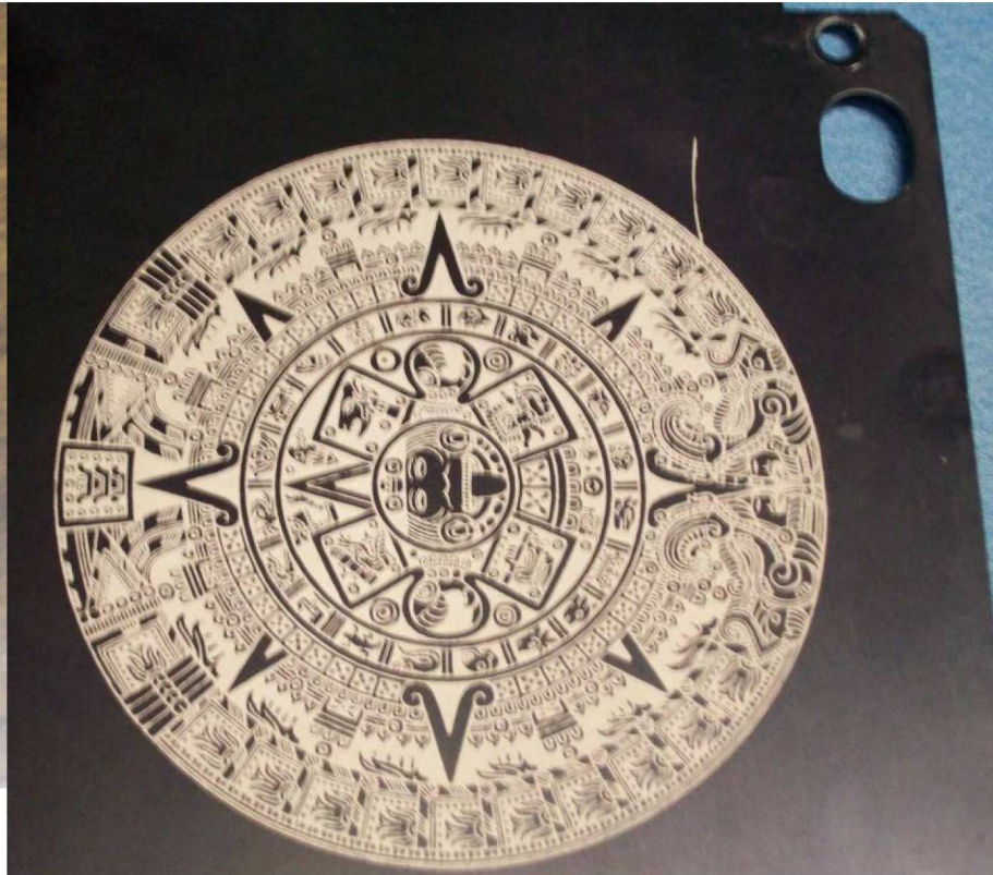
Laser engraving on anodized aluminum