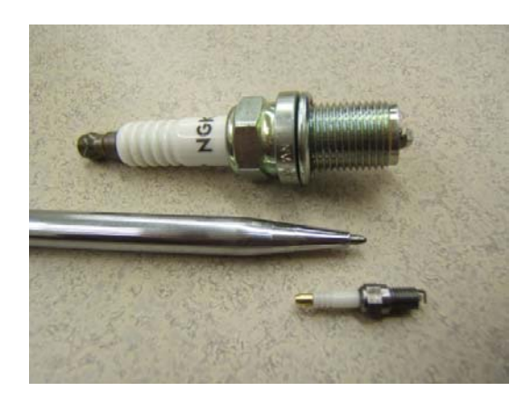
And a close up with the ball point pen, just in case you missed the electrode detail!

Steve's model V8 sparkplug is a marvel of miniaturization. Here it is with a standard sized plug for scale: