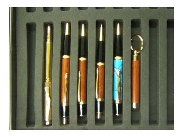
The decorative bodies are can be m ade from exotic woods or acrylic m aterials with unique patterns.